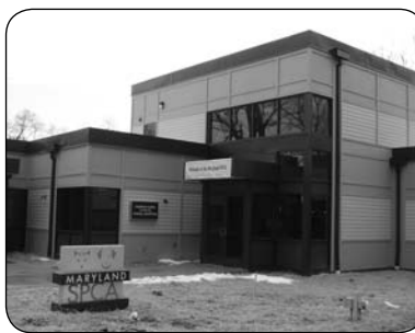
The exterior of our new facility.

private space in which to meet with clients in both the adoptions and admissions areas. Other building highlights include: