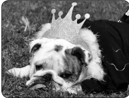
Our exciting March will leave you dog-tired.

Pre-register for the March at the Maryland SPCA Headquarters House on Saturday, April 9 from 9:00 a.m. to 1:00 p.m. or Tuesday, April 12 from 4:00 p.m. to 8:00 p.m. Stop by and pick up your March for the Animals T-shirt, bandana and goody bag! Avoid registration lines the day of the March and be the first to sport the 2011 T-shirt.