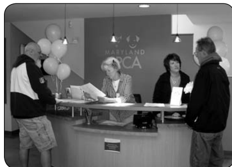
The Adoption Reception Counter on opening weekend.

insulates the building more efficiently than a traditional rubber roof, it also reduces water runoff, promoting wildlife and even lowering ambient air temperature. Plantings will be installed this spring.